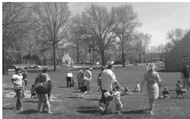
Easter Egg Hunt participants collecting some of the hundreds of eggs hidden around Joe D. Dennis park.