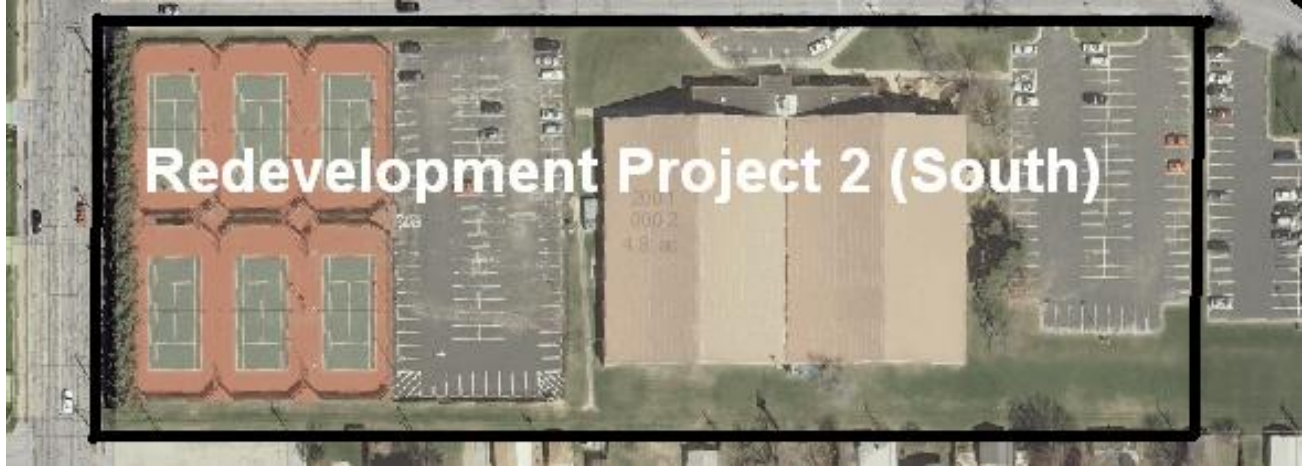
EXHIBIT B SKETCH OF REDEVELOPMENT PROJECT 2 (SOUTH)