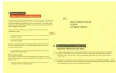
Back of return envelope to complete