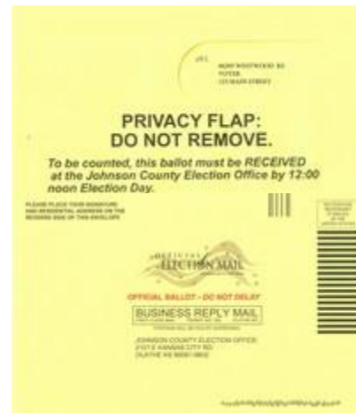
Back of return envelope after sealing